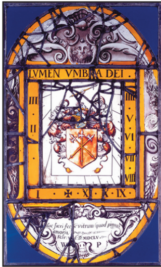
'The Blue Dial', probably by William Price, 1655, restored 1816.