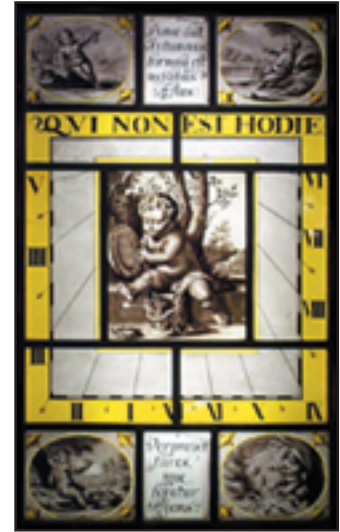
'Cupid and the Four Seasons', Nun Appleton Hall, York, by Henry Gyles, dated 1670 (source: a print by Titian).

Did you know that it is possible to make a stained glass window with the design of an accurate functioning sundial on it? I've learned that this news comes as a big surprise to most people outside of the sundialing community. Imagine a typical stained glass window with an attractive design that includes a sundial face. The outside of the window has a metal rod or sheet attached to it and when the sun shines, a shadow is cast onto the sundial face. Since the glass is translucent, you can read the time from inside or outside the building!